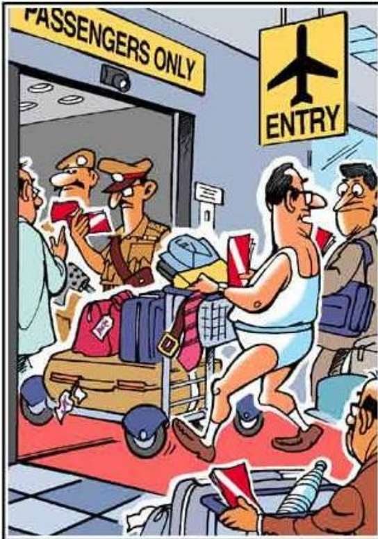
I would prefer to dress up after security check...