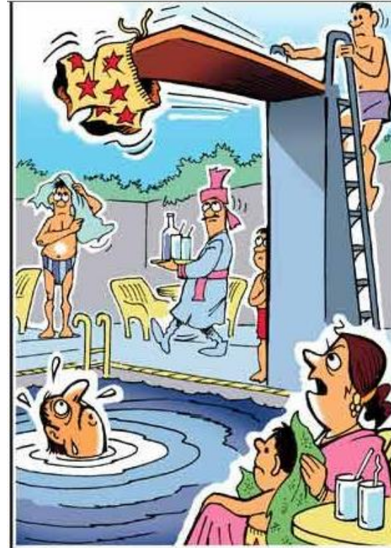
Your diving and driving are the same...Always scraping past the edges!